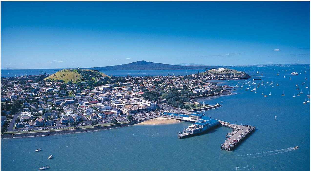
Above: Aerial view of Devonport with Rangitoto Island in the background.