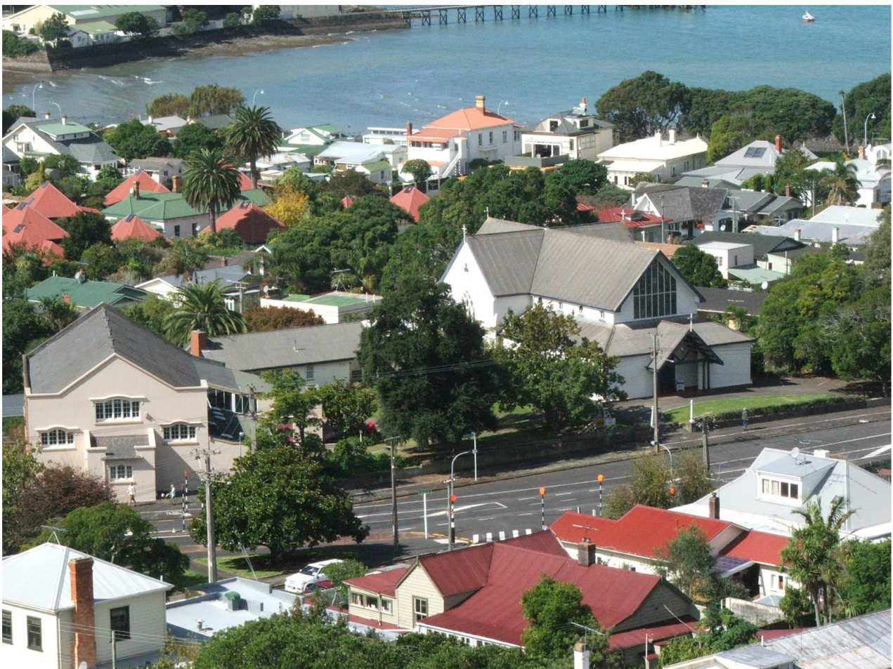
Below: View of Holy Trinity Church from Mt Victoria.